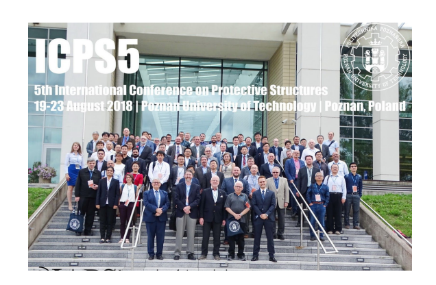
ICPS5 in Poznan - summary